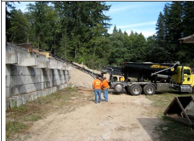
Bankrock gravel shooter